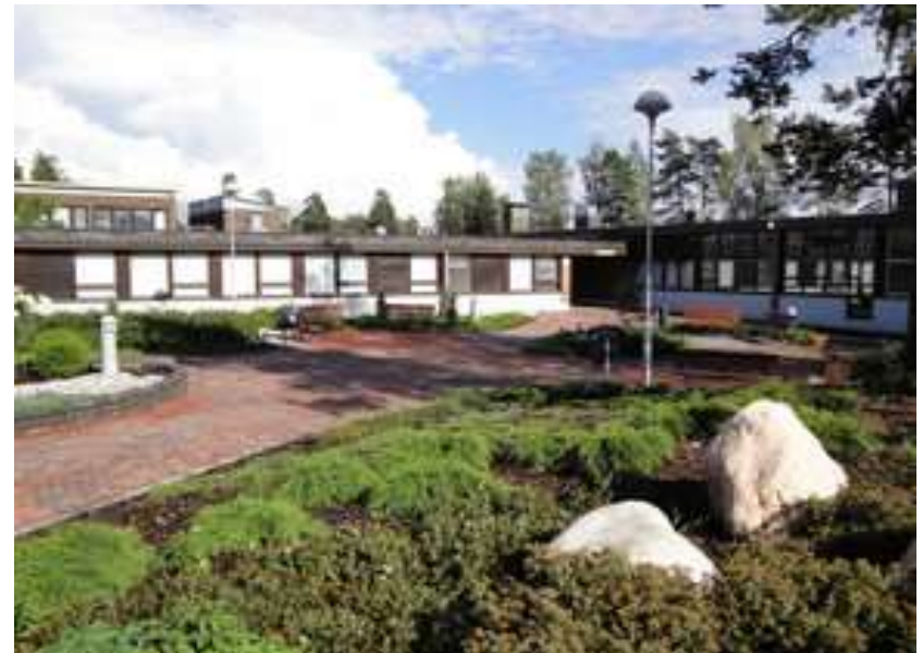
Toivonkatu campus, Lohja