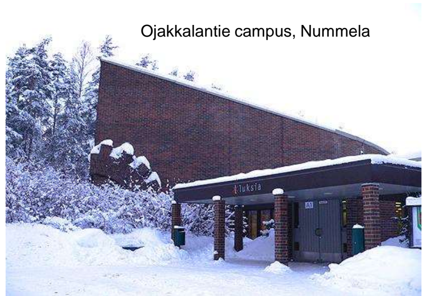
Ojakkalantie campus, Nummela