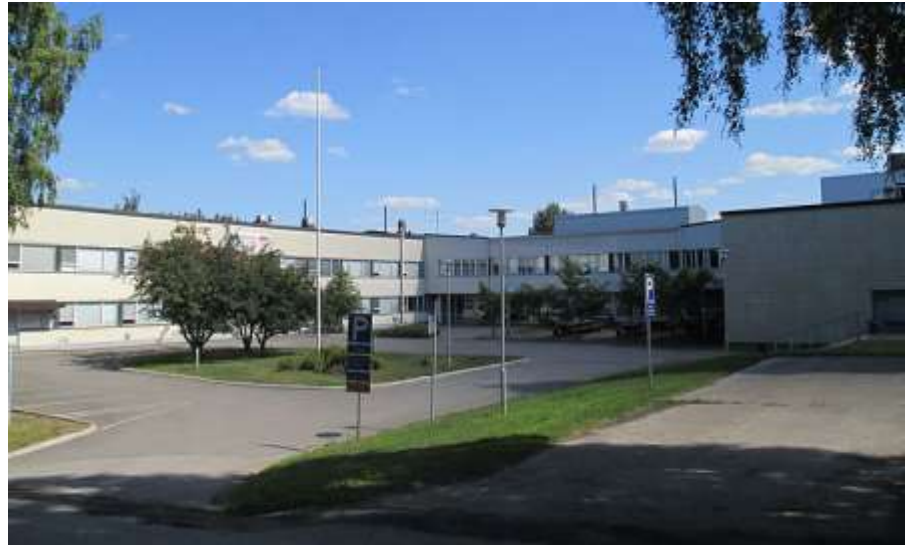
By Tomisti (Own work) [CC BY-SA 4.0 ( http://creativecommons.org/licenses/by-sa/4.0/ )], via Wikimedia Commons